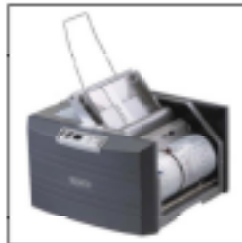
Common Fold Configurations