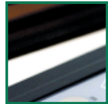
detailed control panel with total and batch count as standard