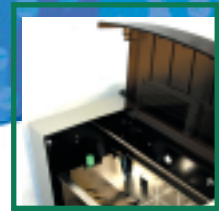
User friendly interface for on-line processing