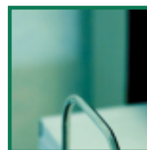
High capacity In-feed tray