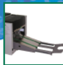
Optional automatic extending conveyor activated by the number of forms processed

Tel: 01493 664204 Fax: 01493 440241 E-mail: sales@gabforms.com Website: www.gabforms.com