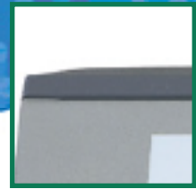
Manual feed option for the processing of individual pressure seal forms

Tel: 01493 664204 Fax: 01493 440241 E-mail: sales@gabforms.com Website: www.gabforms.com