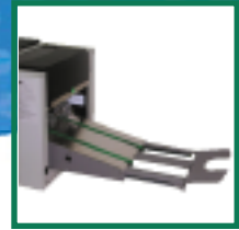
Optional automatic extending conveyor activated by the number of forms processed

Tel: 01493 664204 Fax: 01493 440241 E-mail: sales@gabforms.com Website: www.gabforms.com