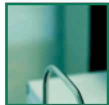
High capacity In-feed tray